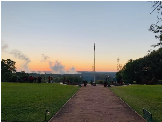
The spray is visible from the Victoria Falls Hotel.

not as visually impressive since there is not as good a viewing point on the ground. On the other hand, it was quite impressive to be so close to it that you had to wear a raincoat to stay dry in the spray. The roar was almost deafening. (See the picture at the top of this article.)