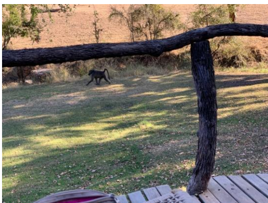
At Mala Mala, we could see baboons and impala from the deck of our luxurious cabin.