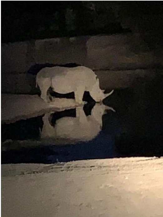
After our first game drive, coming back in the dark, we spotted a white rhino at a pond.