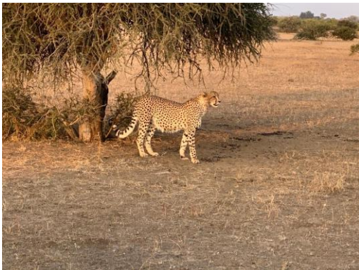
At the end of the day, our final sighting was a cheetah. We were alerted by the other vehicle, and we drove 30 minutes to see it. Cheetah population has decreased by a factor of 10 in the last 100 years. It's quite surprising that we can get so close to these animals and are completely ignored.