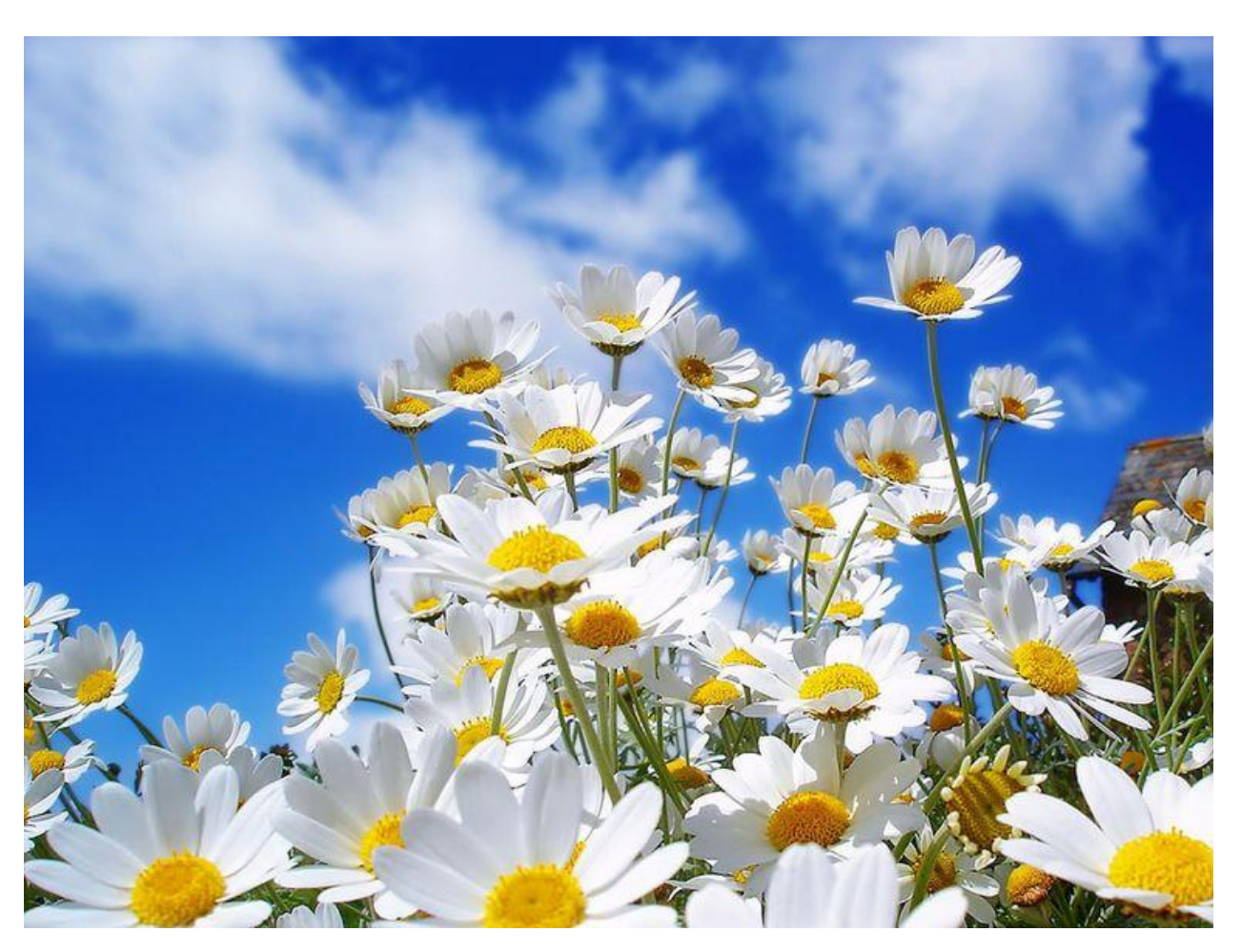
Happy First Day of Spring!