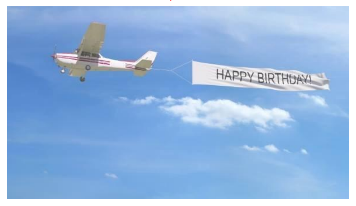
Amelia Earhart's Birthday Party 1:00 - 4:00 Laconia Airport. NH (LCI)

Eastern New England Chapter event - Everyone invited - bring your spouse, your significant other, your friends!