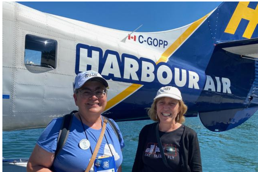
Several of us took a flight over sea & mountains