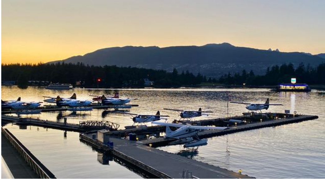
Vancouver Harbor is a seaplane base!