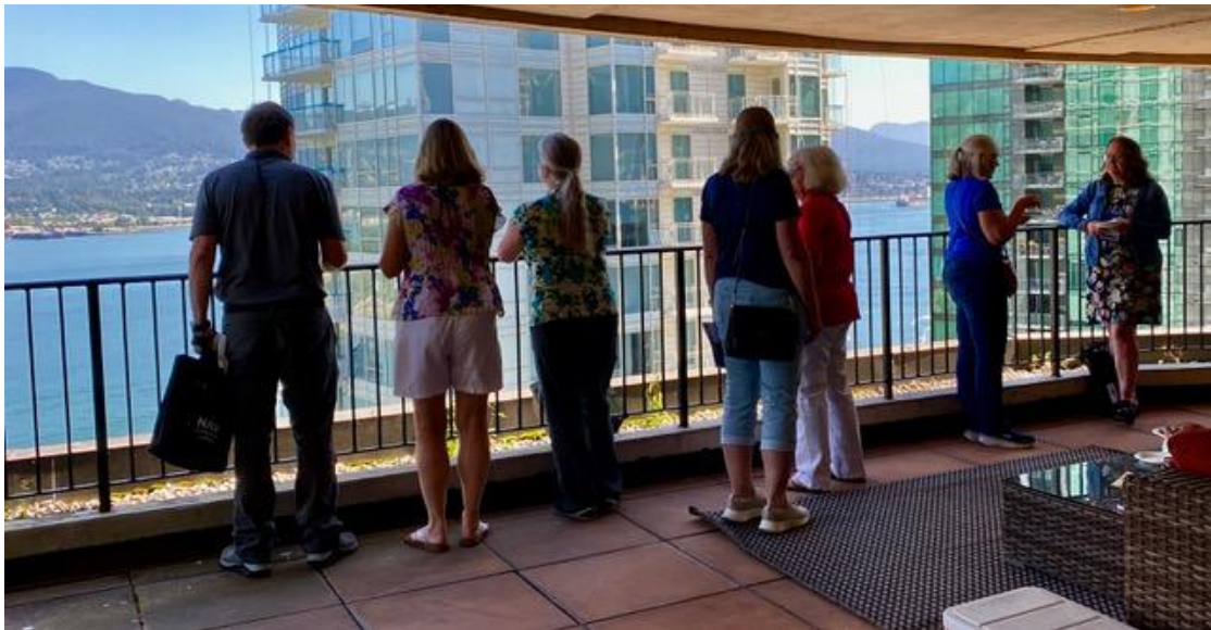
Hospitality Suite balcony overlooking Vancouver Harbor

Did you know in 1978 Ben and Jerry made ice cream great? If you ate naughty foods and you have some guilt, Take a bike ride around the lake trail they built. Some would enjoy a cruise and dinner - The view from the water is surely a winner. As the evening winds down and you need a good laugh, Enjoy the VT comedy club. It's a blast and a half! Where would you keep all these new interesting facts? When it comes to that, you can truly relax. The world's tallest file cabinet is located here. They will all fit in there, never you fear. Now that you know about Burlington, Its praises, you'll be a signing 'em! You didn't think we could rhyme that, did you? But we 99s, we can do anything. It's true!