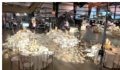
The New England Air Museum, Windsor Locks, CT

Dinner $90.00 per person Attire: Dressy Casual *cash bar