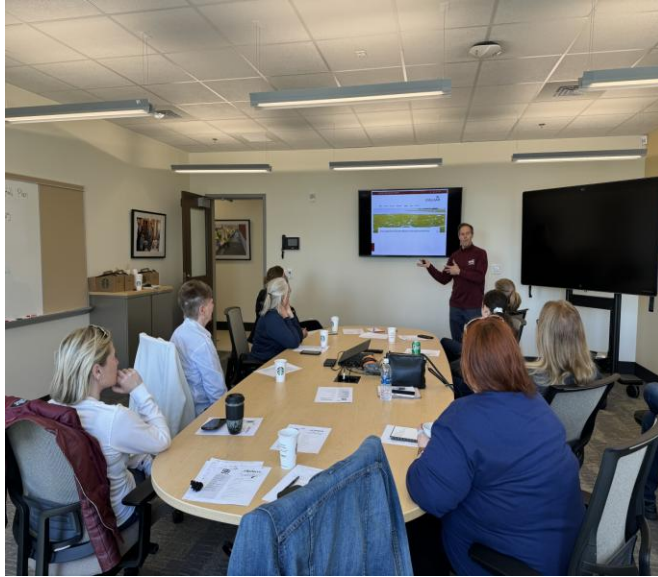
Instruction begins in the classroom.