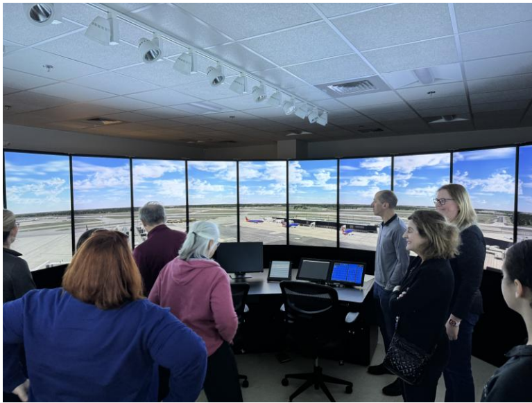
Air Traffic Controller trainees then move to a 22-panel, 360-degree full size simulator. The airport can be changed as needed (this is BMI) and various scenarios presented in the safety of the simulator.