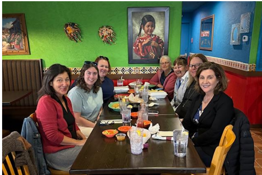
Lunch at La Frontera Mexican Restaurant